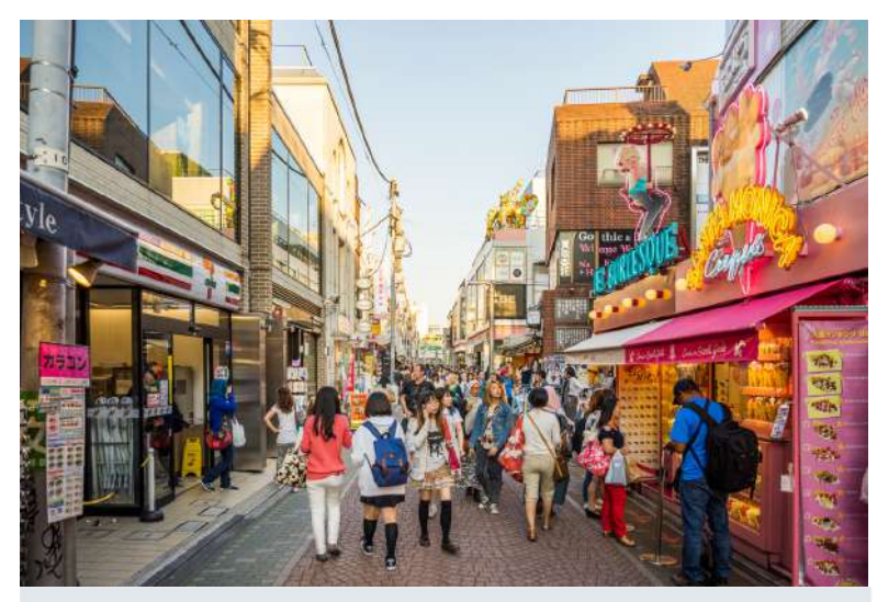
Takeshita Street (Harajuku)

Harajuku is one of the most extensive gatherings points for Tokyo's diverse fashion tribes. Tightly packed shopping bazaar Takeshita-dōri is a beacon for teens all over Japan.