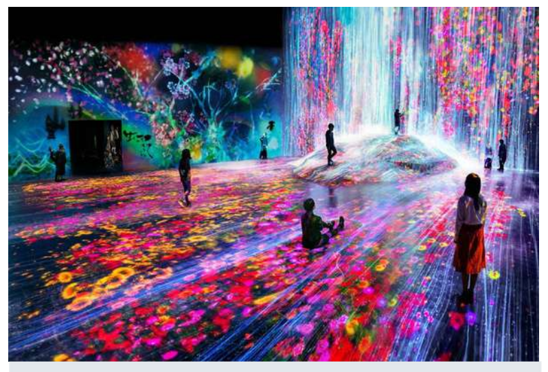
Teamlab Planet Tokyo

teamLab Planets Tokyo is a digital art museum that offers an immersive experience, blurring boundaries between art and viewer. Each room is a world of its own, filled with floor-to-ceiling projections that react to visitor movements. From floating through a universe of light to walking barefoot through mirrored pools, it's truly a sensory feast..