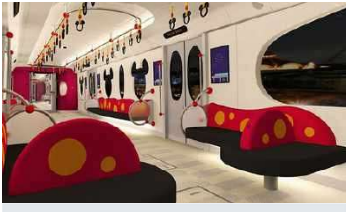
Disney Resort Train (inside)

09:00 Pick up at the hotel 09:15 Transfer to Disney Resort 10:00 Free time at Disneyland/Sea 19:00 Transfer to hotel