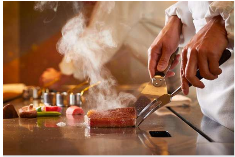
Wagyu beef course at one of the best teppanyaki restaurants in Tokyo

Before check-in at the hotel, you can enjoy wagyu steak lunch at one of the best teppanyaki restaurants in Tokyo.