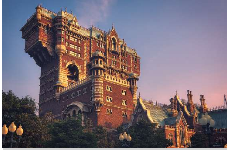
Tower of Terror