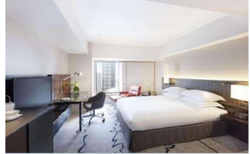
Hilton Tokyo Shinjuku/similar