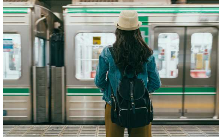
Public Transport ( NO SERVICE )

Upgrade from public transport to private car: