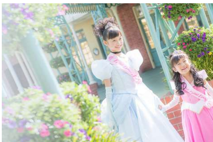
Bibbidi Bobbidi Boutique