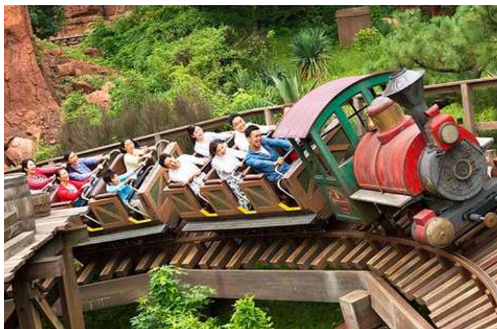
Big Thunder Mountain