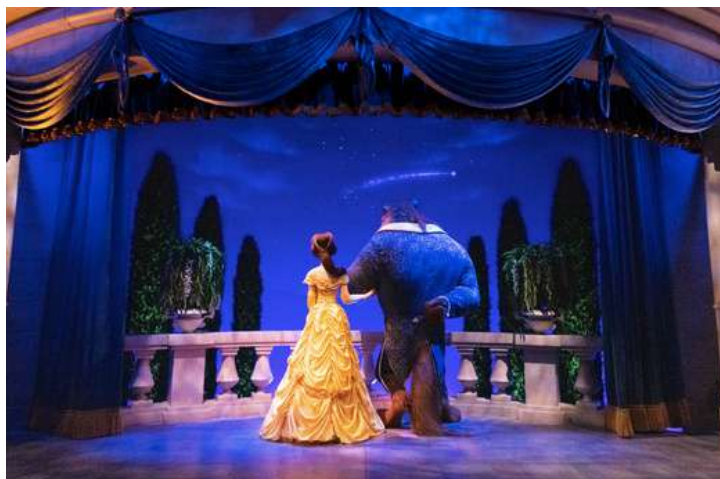
Beauty and the Beast

Experience the magic like never before at Tokyo Disneyland! From enchanting Cinderella's Castle to exhilarating rides like Space Mountain, this iconic theme park uniquely blends classic Disney charm and Japanese hospitality. Below is the best attraction at Tokyo Disneyland.