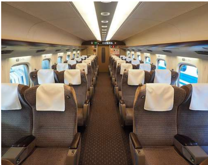
Business Class Shinkansen to Osaka

Today, you will transfer to Tokyo Station and board the bullet train to Kyoto (Green car train tickets included). After you arrive at Kyoto Station, our driver will pick you up and explore the best destination in Kyoto.