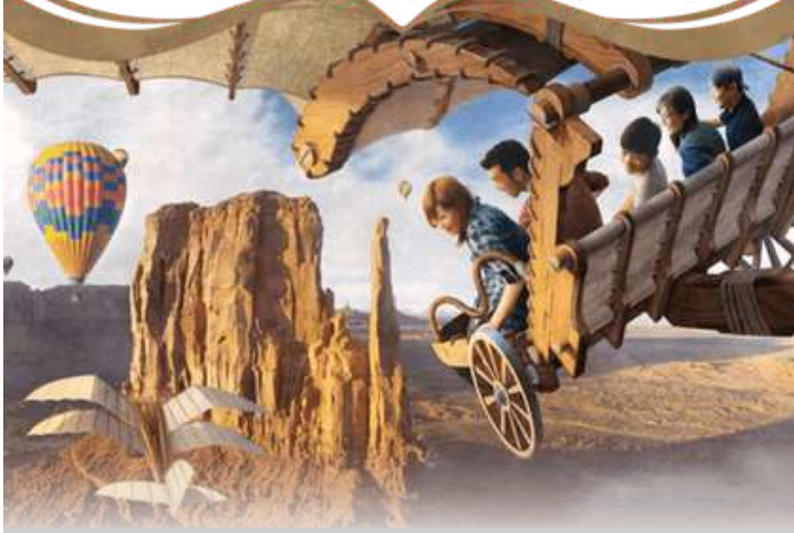
Soaring: Fantastic Flight

Dive into a world of adventure at Tokyo DisneySea, where imagination meets the sea. Explore seven unique ports like the Arabian Coast and Mysterious Island, each bursting with cutting-edge rides, shows, and attractions. Below is the best attraction at Tokyo DisneySea.