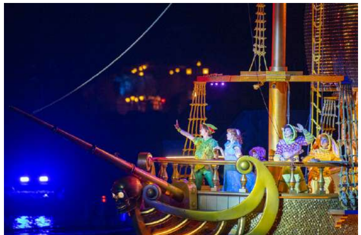
DisneySea Believe Sea of Dreams