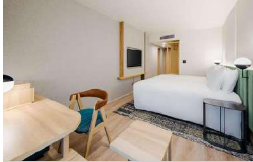
Hilton Garden In Kyoto/similar