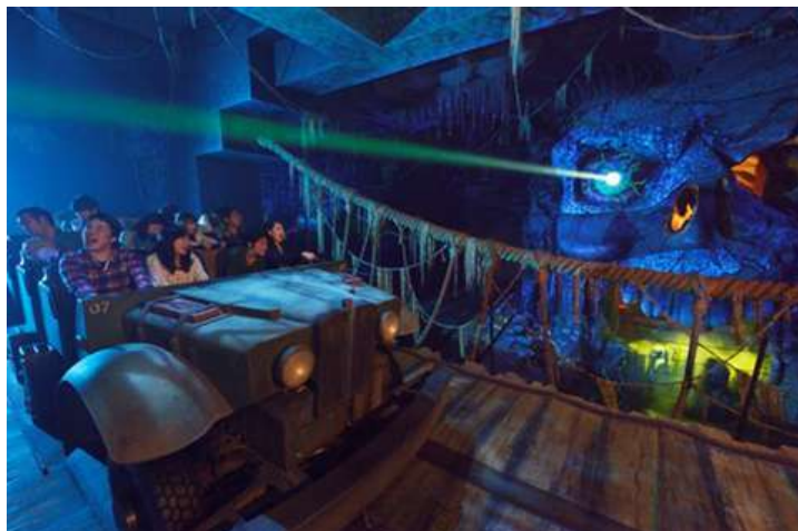
Indiana Jones Adventure