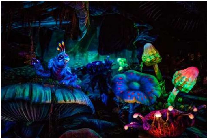
Journey to the Centre of the Earth