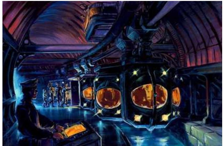
20,000 Leagues Under the Sea