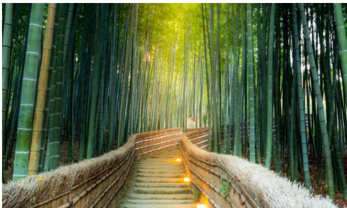
Arashiyama Bamboo Forest