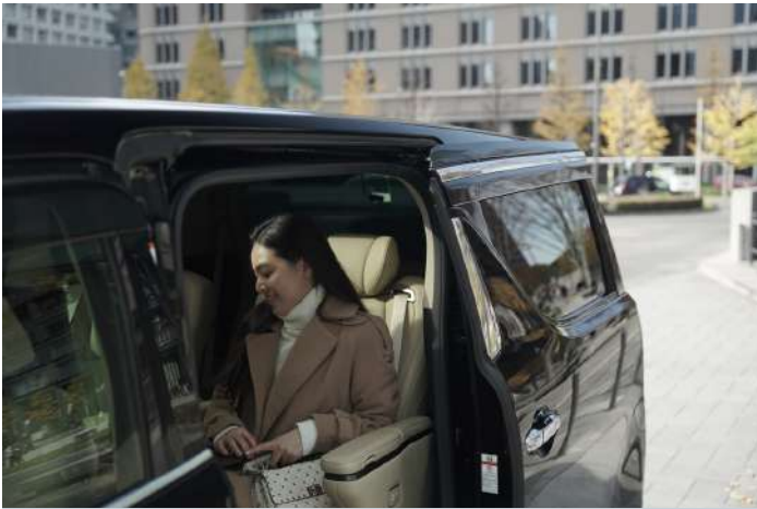
Private Car (Alphard/Hiace)