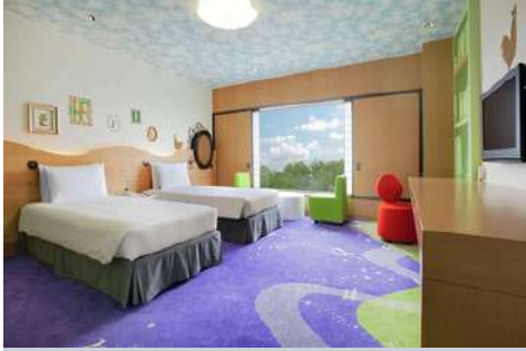
Hilton Tokyo Bay/similar