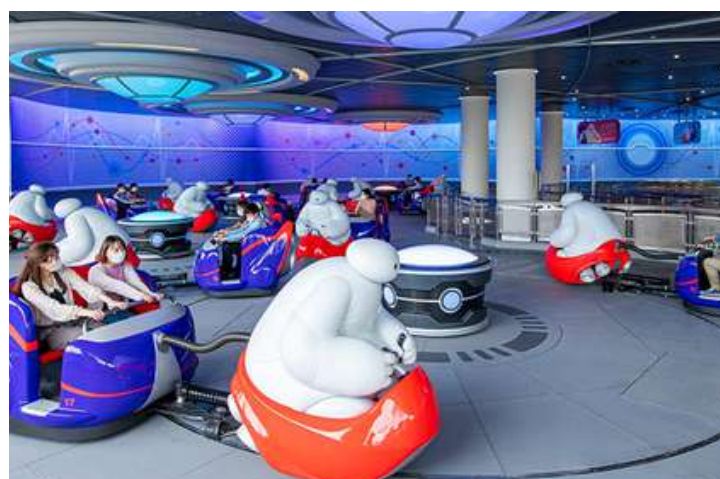
Happy Ride with Baymax